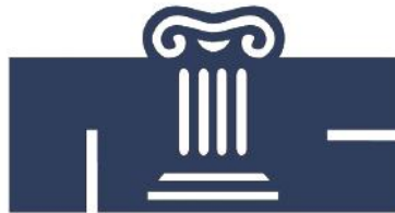
North-American Interfraternity Conference