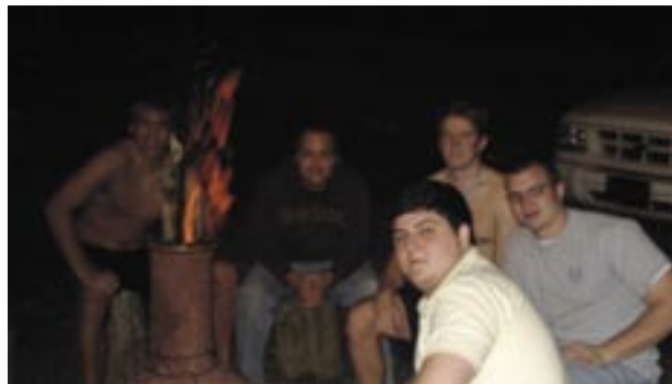
A few brothers relax by a fire while spending the holidays together.

Throughout the Spring 2007 semester, there are a few notable events scheduled. First, we have our annual MLK weekend ski trip in the mountains of Snowshoe, West Virginia. In late February, our undergrads will partake in a formal weekend away from campus. In March, we will host a parents' day weekend. (Alumni are also welcome to attend.) The afternoon will include a baseball game at 1:00 p.m. followed by a dinner and awards ceremony. To finalize our social calendar, the undergrads will have yet another chance to apply their engineering skills for the week-long Luau preparation. We are going to start updating our website on a regular basis to keep you informed of current events. Hope to see everyone in 2007.